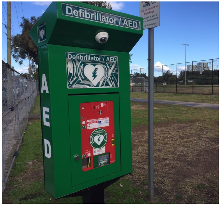
SIMILAR TO ZAP STAND DEFIBRILLATOR

KEORIDE - NEW APP "Ride now or later, you can book rides on-demand or pre-schedule them up to one month in advance. We'll do our best to make sure you get your pre-scheduled trip. If there's ever a time when we're experiencing a high demand and can't find you a vehicle, a Keoride team member will get in touch to assist with your travel plans.